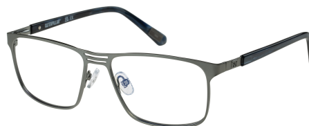
CTO-3024-005 Matte gunmetal