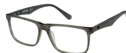
CTO-3020-108 Gloss grey horn