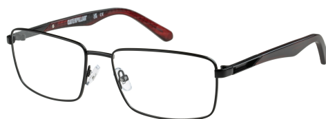
CTO-3032-004 Matte black / Burgundy