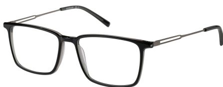
CPO-3529-104 Gloss black / Gunmetal