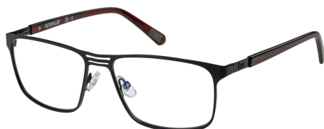
CTO-3024-004 Matte black