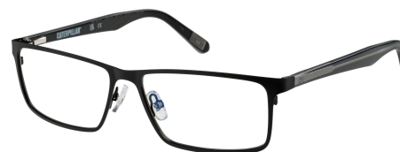
CTO-3021-004 Matte black