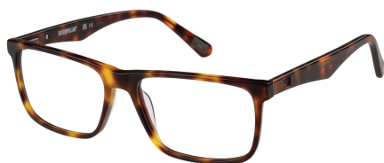
CTO-3020-101 Gloss horn