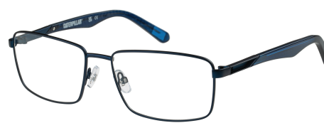
CTO-3032-006 Matte navy / Blue