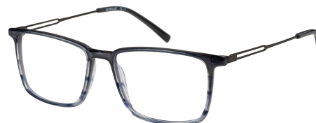
CPO-3529-106 Gloss navy fade