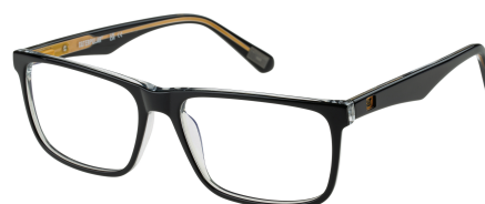
CTO-3020-104 Gloss black / Crystal