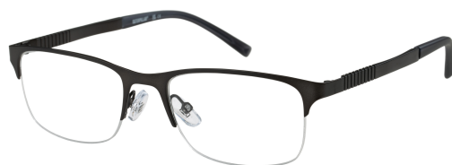
CPO-3533-005 Matte black