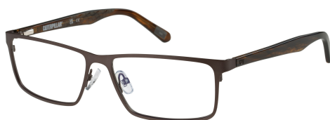
CTO-3021-003 Matte brown / Horn