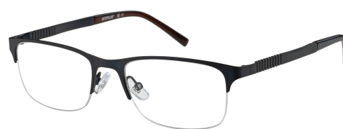
CPO-3533-006 Matte navy